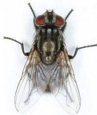
The FACE FLY (musca autumnalis)

Cluster flies enter houses and other shelters in the fall. They tend to cluster in large numbers at windows, ceiling or other high places. While they are highly annoying they do not damage structures and are not known to carry disease. They live outdoors and feed on nectar until they enter buildings to hibernate as it gets colder. Rather than fly through open doors or windows they tend to crawl through small openings. They may first gather on the outside of the warm side of a building during the day. The overwintering adults are concealed and not known until they begin emerging in large numbers.