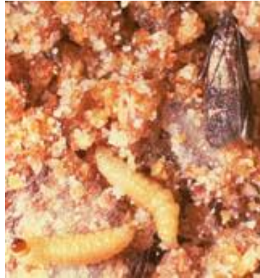
larva or worm stage

Indian Meal moths develop in many kinds of stored foods. Coarsely ground grains and cereal products are commonly infested. They are also found in herbs, dried fruits, nuts, dried pet foods, flaked fish food and bird seed. They can also breed in ornamental items made of dried flowers and seeds.