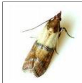
Indian Meal Moth

Eggs of either moths or beetles may hatch inside packages if they become old at a warm temperature. Larva may crawl into other products or the adults may crawl or fly to other areas. Once insects are present in drawers and cracks they will infest new product. Many types of food products may be infested; cereal products, flour, cornmeal, spices, dry pet food, nuts and related. The first step in control is always to find and eliminate the source. This means opening all potentially infested packages. Secondly, clean the spillage from all drawers and cracks. People often underestimate the thoroughness needed in these two steps. You may have to repeat it a number of times before all insects are eliminated. Adult moths are easily killed with a household aerosol labeled for flying insects. Be sure to follow label directions. Adult beetles are more difficult. Remember to only buy quantities of rice, cereal products, spices and related that can be used up in a reasonable time. Avoid storing them long periods and keep any spillage cleaned up.